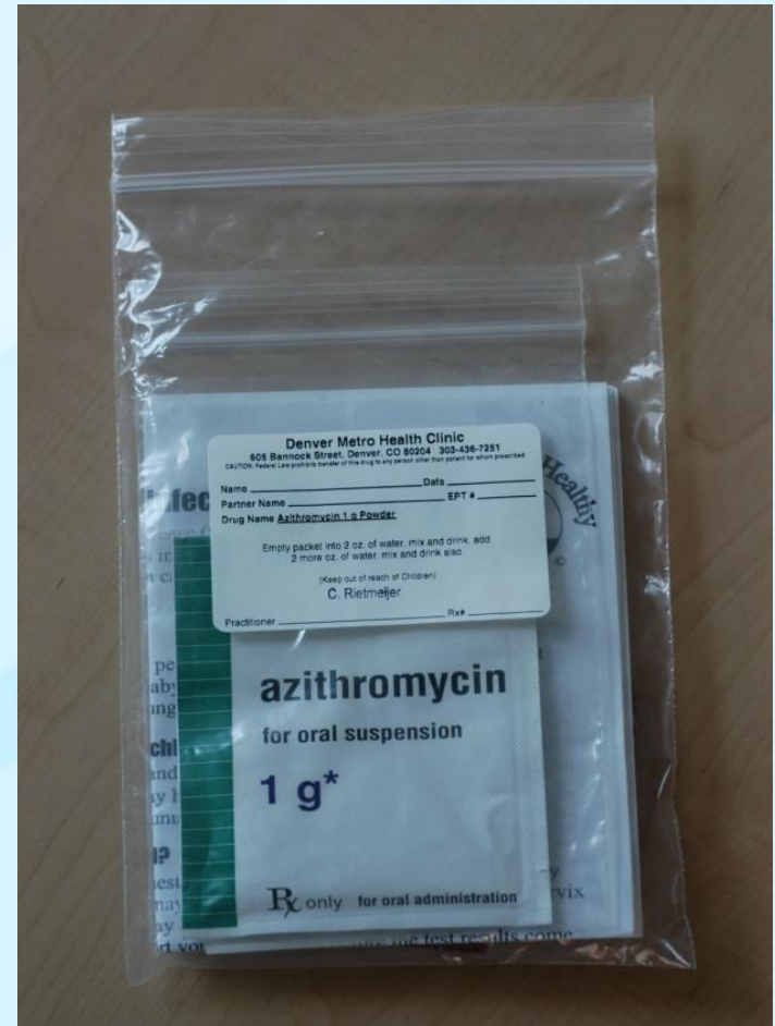
Partner Pack: Chlamydia